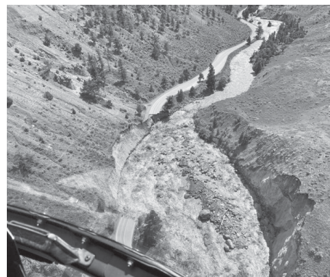
Northern Yellowstone June 2022 flooding

Through these partnerships with Xanterra Yellowstone National Park, we produced 44 published stories and national live TV segments from 22 media attendees. The total reach from these partnerships was over 700 million in readership and viewership. Stories continue to be developed from these partnerships into fiscal year 2023.