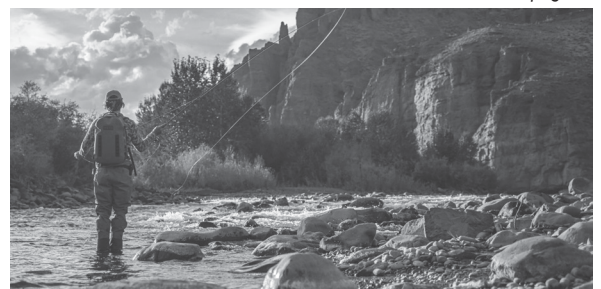
Emmy Award winning marketing campaign "Find Your Moment."